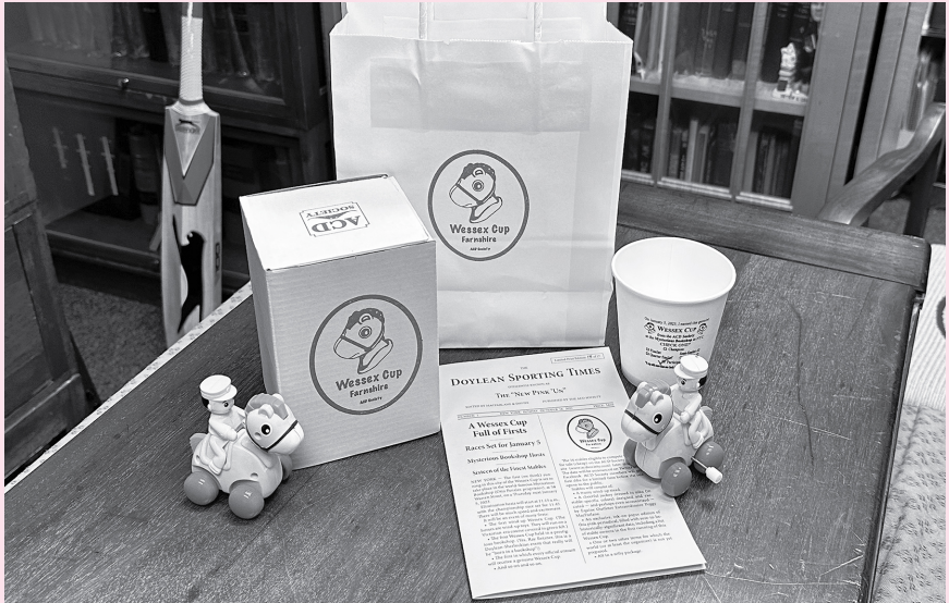
A Wessex Cup stable, with unadorned horses and without this issue of The Doylean Sporting Times.