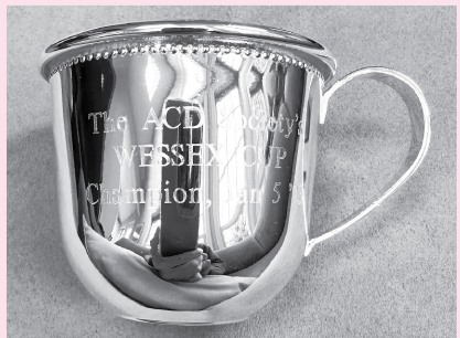
The Wessex Cup champion trophy.

The champion will receive a trophy, as well as bragging rights until the next running of the Wessex Cup.